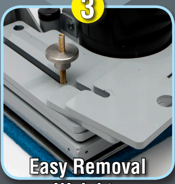
Easy Removal Weights