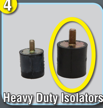
Heavy Duty Isolators