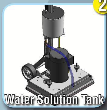
Water Solution Tank